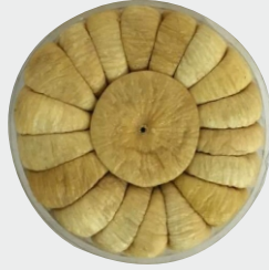
Garland ( pre-packed ) Available sizes; 6-7-8-9 Garland figs have got the same shape as the 'Lerida' type, but have been strung on a raffia string. The only packages are generally round shape cello and PVC trays 200 gr, 250 gr and 500 gr packages