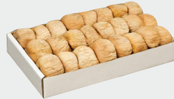
Pulled (Pre-packed) Available sizes ; 3-4-5-6 Pulled figs are strongly stretched and given a semi-spherical shape. This kind requires specially selected figs and the pulled type is therefore one of the best qualities. Pulled are packed in pre-packed 250, 400 and 500 gr to untill 5 kg cartons or smart smart wooden packages as well