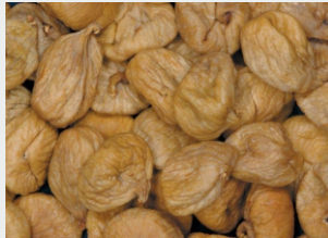
Natural-bulk ( Bulk and/ or pre-packed); Available Sizes ; 1-2-3-4-5-6-7-8-9-10 Natural figs are indeed waccum fimugated bu not manipulated at all, are supplied in selected quality. Selected natural figs are calibrated and hand-selected; contain only a trifling percentage of slightly damaged fruits. They are supplied in 12,5 kg boxes and in linen or cellophane or polyethylene bags of 500 g or 1 kg.