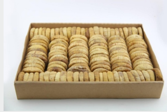
Lerida ( Bulk and/ or pre-packed ) Available sizes; 1-2-3-4-5-6-7-8 Lerida figs are flattened and line up in their packaging which is bulk boxes ,cartons ,PVC or Wooden boxes and Cello packs of various weights between 250 gr pre-package to untill in 12,5 Kg bulk packages