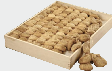
Baglama (Bulk /or pre-packed) 1-2-3-4-5 Baglama figs are similar to the protoben type but bound together with raffia string, each fruit being tied by the stalk. The arrangement in boxes or cartons , baskets 12,5 kg is the same for the 'Protoben' . 'Baglama' can be packed in small trays or packs of 500 gr