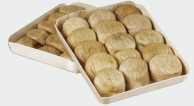
Protoben (Bulk and/or pre-packed ) Available sizes ; 2-3-4-5-6-7 Protoben figs are the long shape given to the fruits during manipulation , protoben figs supplied wooden boxes and cello packs of various weights between 250 gr pre-package to untill in 12,5 Kg bulk packages as well